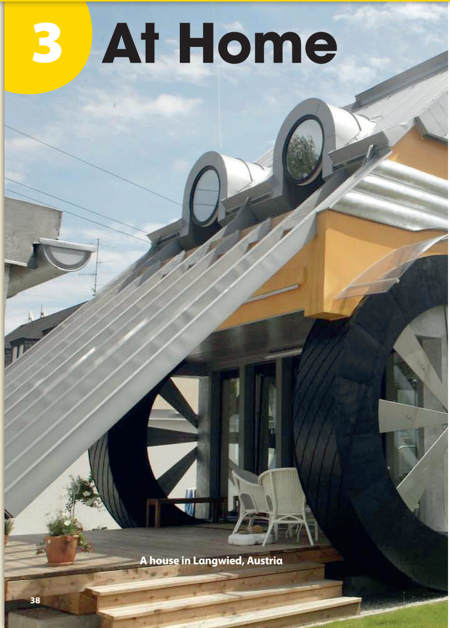
A house in Langwied, Austria