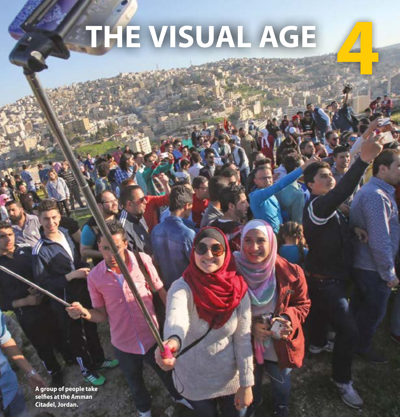
A group of people take selfies at the Amman Citadel, Jordan.