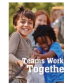
Teams Work Together