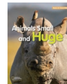
Animals Small and Huge