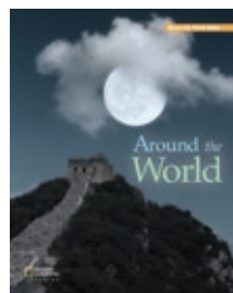
Around the World

Extra phonics support with READ ON YOUR OWN