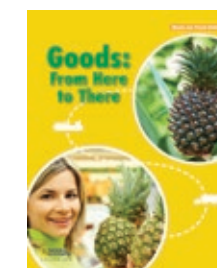
Goods: From Here to There