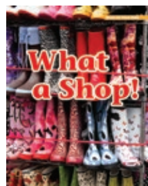
What a Shop!