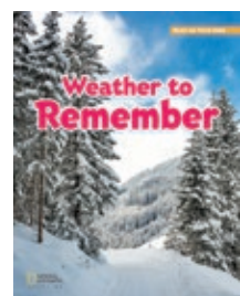
Weather to Remember