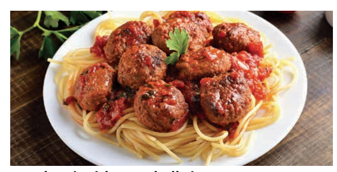
spaghetti with meatballs in tomato sauce