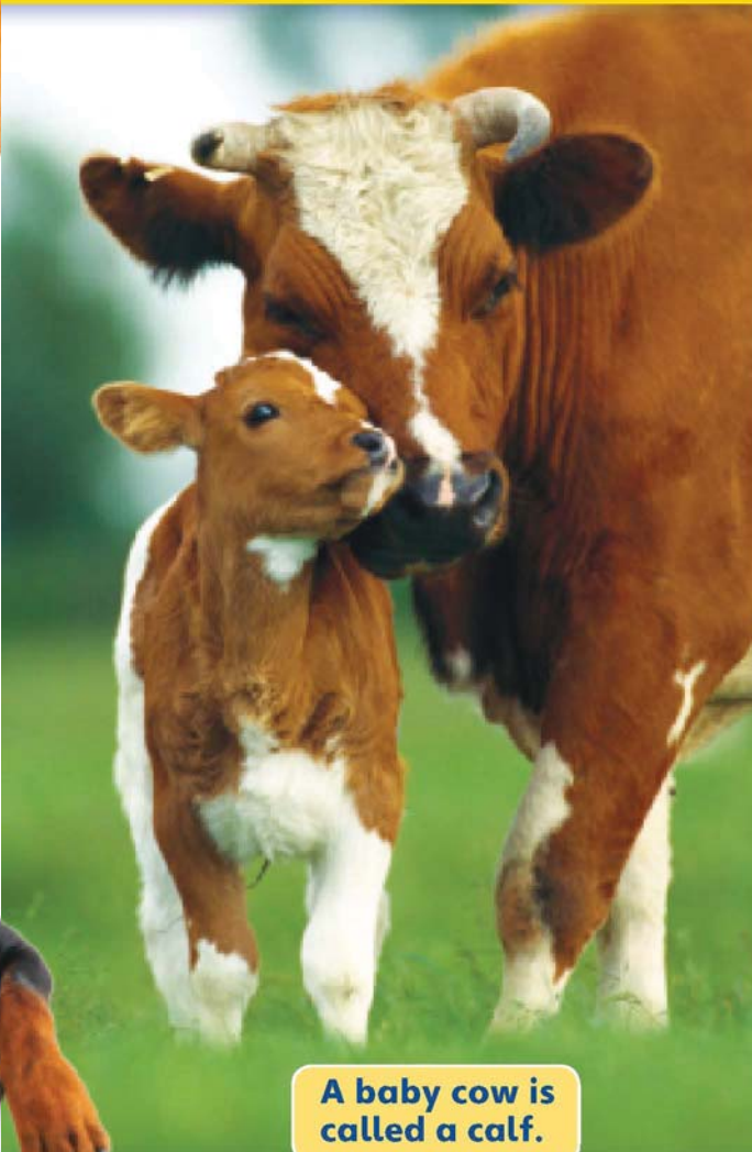
A baby cow is called a calf.