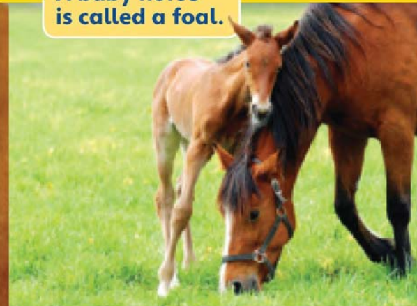
A baby horse is called a foal.