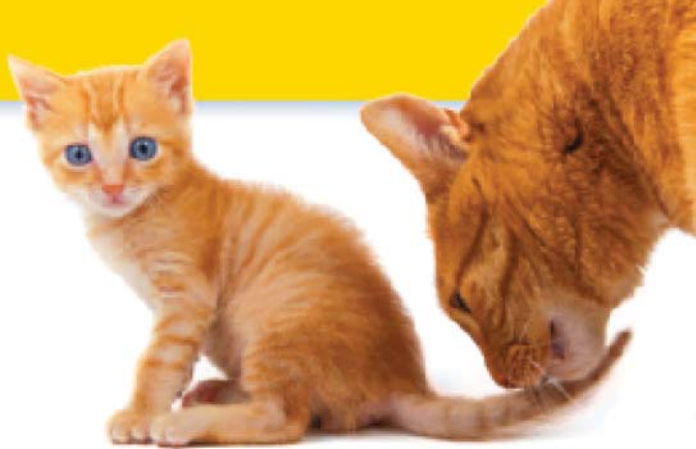
A baby cat is called a kitten.

Baby animals usually have special names.