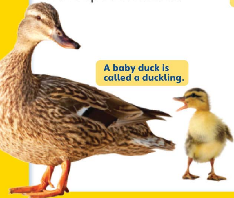
A baby duck is called a duckling.