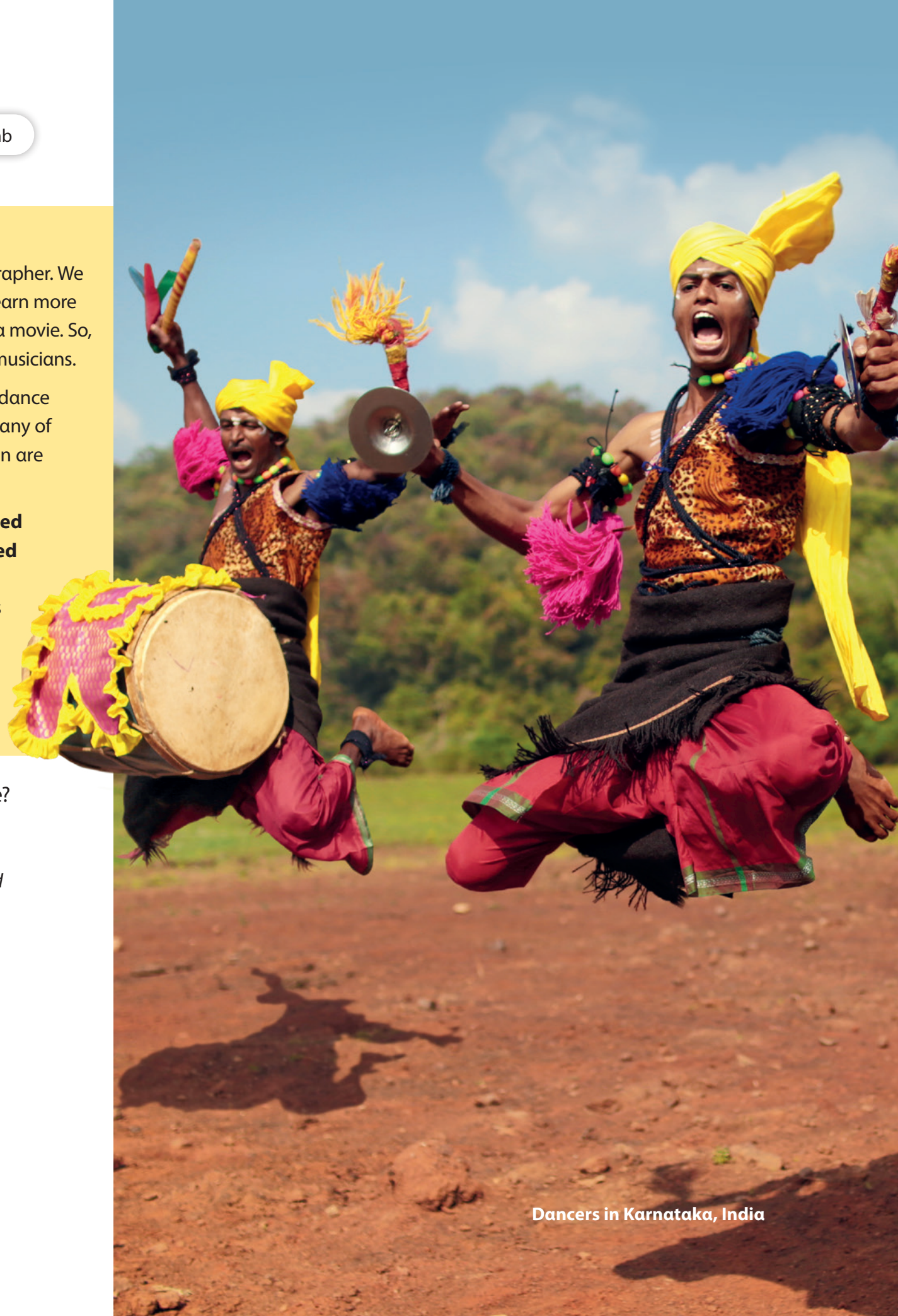
Dancers in Karnataka, India