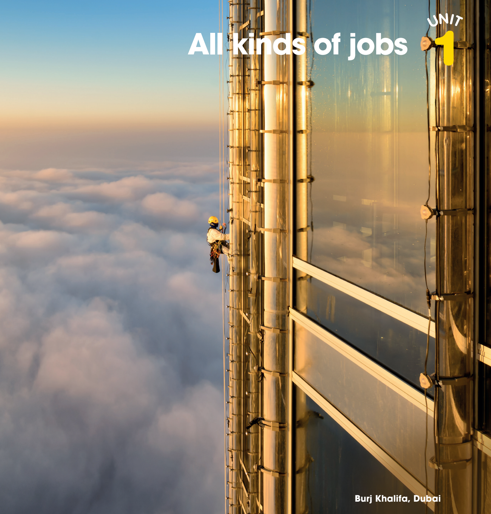
Burj Khalifa, Dubai

Look at the photo. Answer the questions.