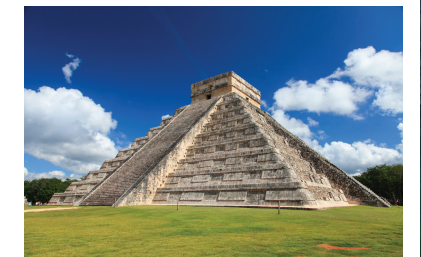
Ruins of Chichen Itza in Mexico