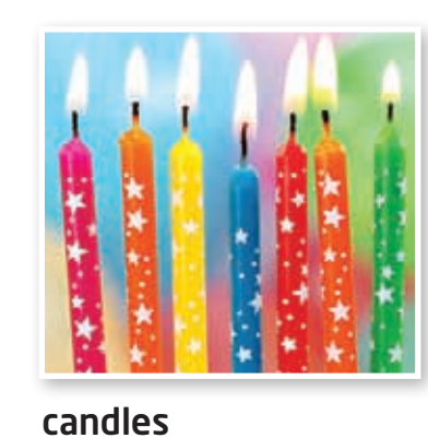
a birthday cake