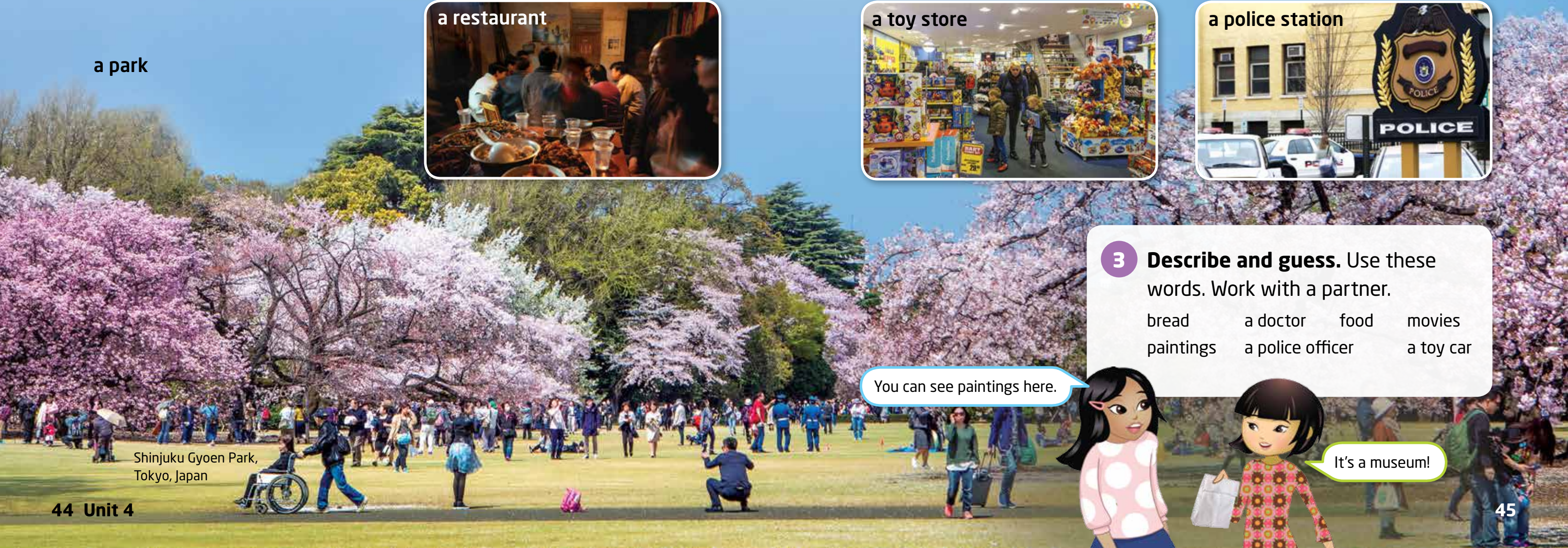
Shinjuku Gyoen Park, Tokyo, Japan

3 Describe and guess. Use these words. Work with a partner. bread a doctor food movies paintings a police officer a toy car