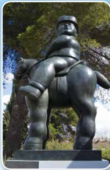
Fernando Botero's Man on a Horse