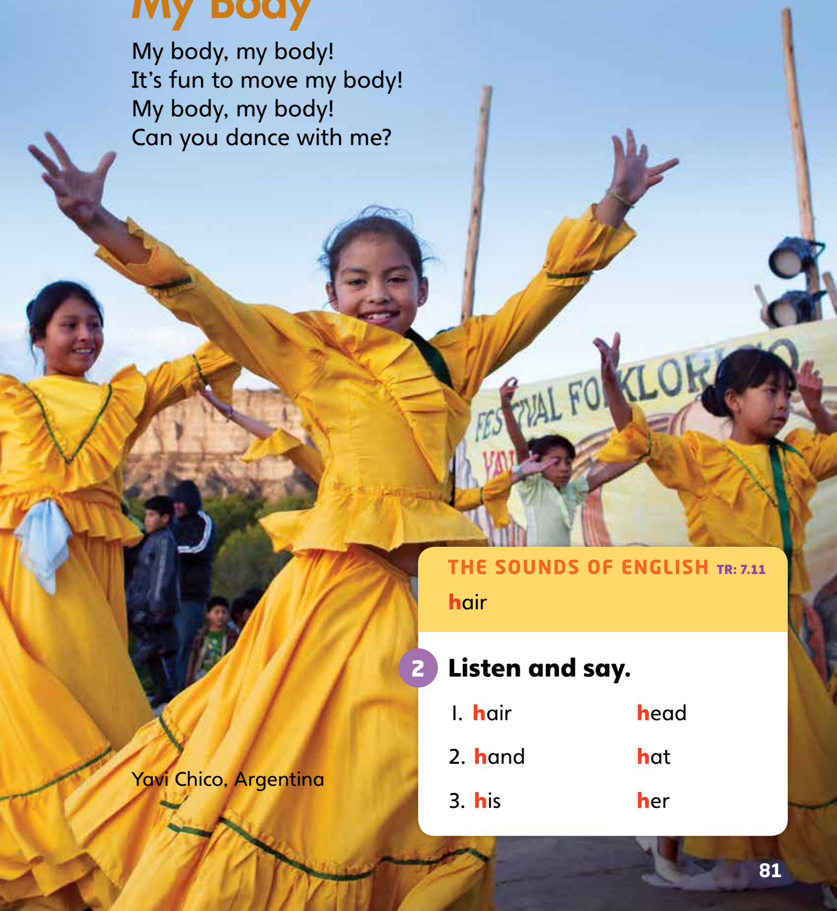
Yavi Chico, Argentina

My body, my body! It's fun to move my body! My body, my body! Can you dance with me?